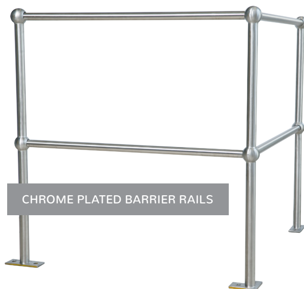
CHROME PLATED BARRIER RAILS