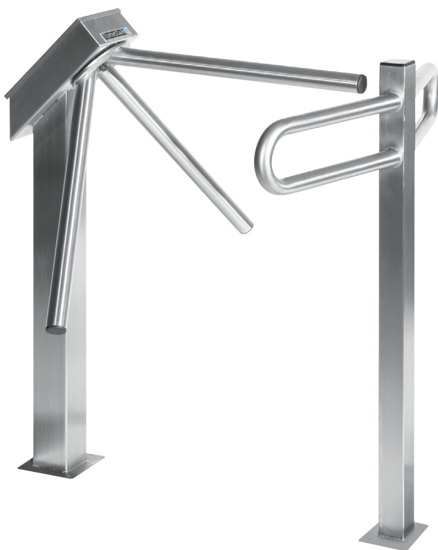
SUPERMARKET HELICOPTER TURNSTILE WITH TURNSTILE SCREEN