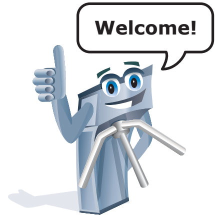
Tridey™ is a member of the Turnstar family