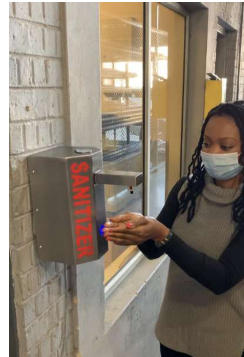
Automatic hand sanitiser